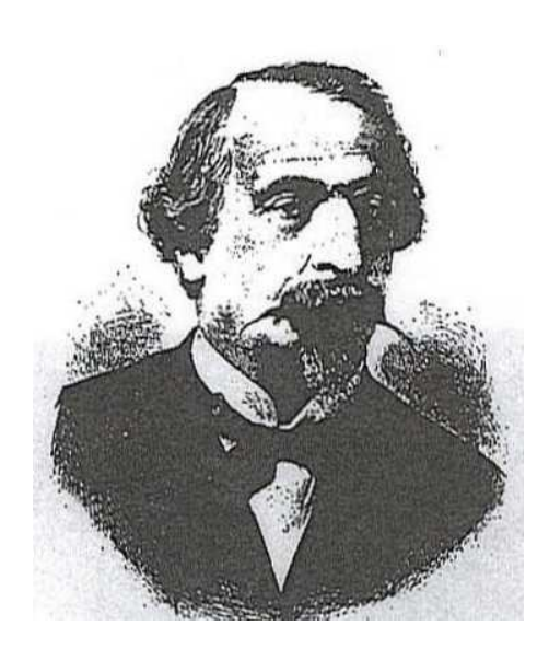
Napoleon, III ruled France from 1848 to 1870